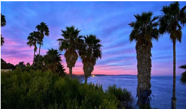
Sunrise session at Swami's, near Encinitas, California. Water temperature 68. Air temperature 72. Surf 4 to 6 foot.